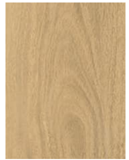
525 Alpine Gum