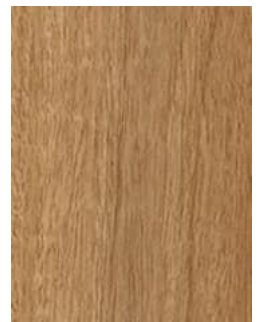
556 Spotted Gum