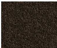
Deep Night 01