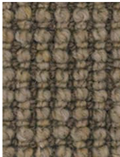
930 Alpine Daisy