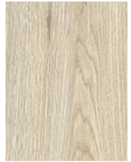
520 Toi Toi