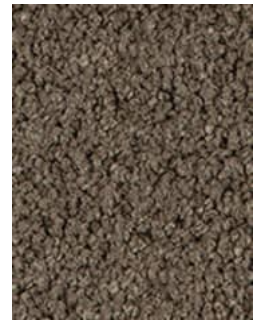
750 Silver Chalice