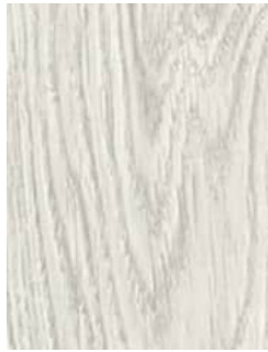
120 White Iris