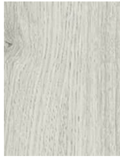
130 Silver Lilly