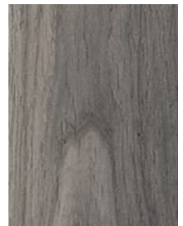
760 June Mist