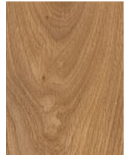
530 Summer Grace