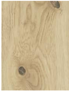
500 Alpine Oak