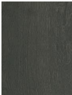
780 Matt Black