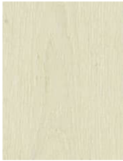
100 White Sands