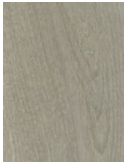
750 Silver Finch