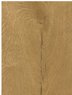
520 Autumn Amber