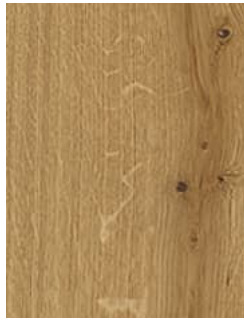
510 Summer Blonde