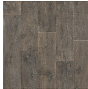
Texas Oak 620D