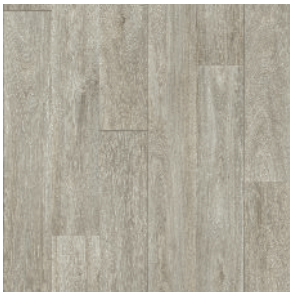
Havana Oak 019S