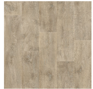
Texas Oak 630M