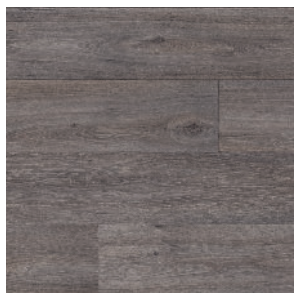
Havana Oak 966D