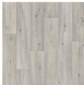
Silk Oak 916L