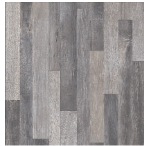
Holm Oak 969M