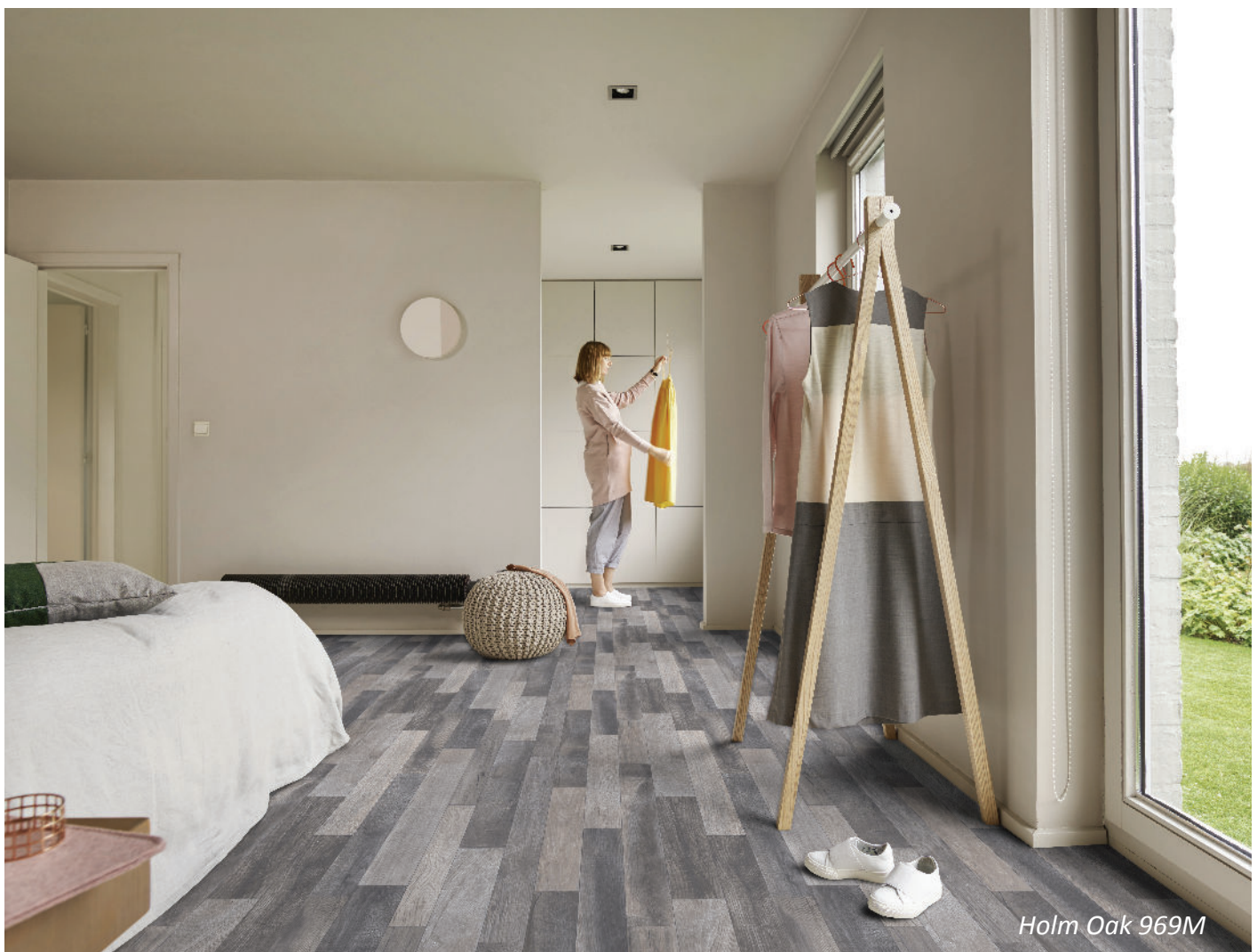
Holm Oak 969M