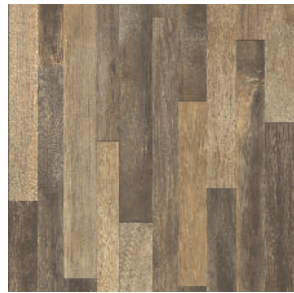
Holm Oak 619M