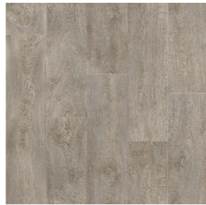
Texas Oak 603M