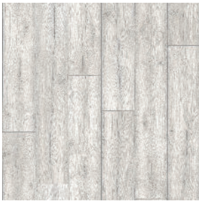
Antique Oak 091S