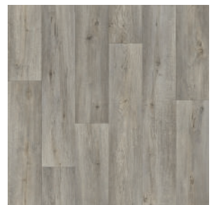
Silk Oak 979L