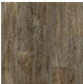
Texas Oak 693D