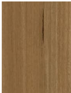
655 Forest Reds