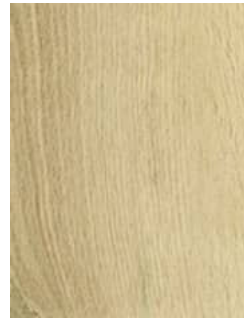
300 Autumn Oak