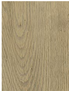
540 River Oak