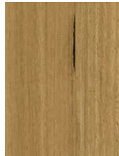
550 Western Tallowood