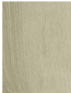
710 Frosted Oak