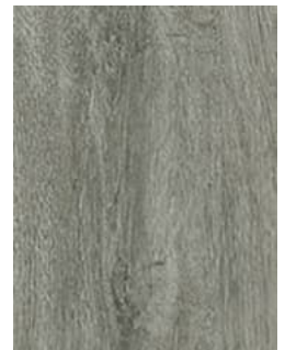
750 Carbonised Oak