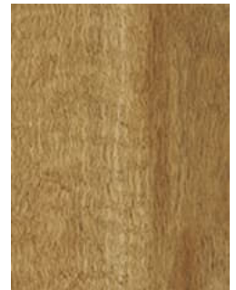
555 Spotted Gum