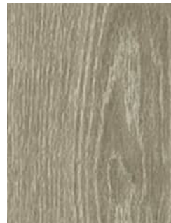
720 Summit Oak