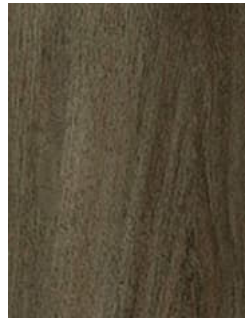
180 Fumed Oak