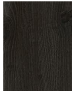
790 Wayward Oak