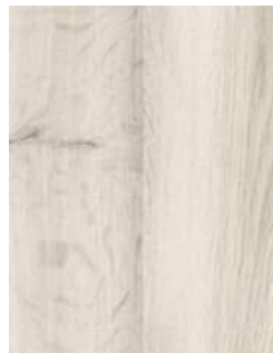
700 Summit Oak