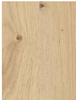
510 Mornington Oak