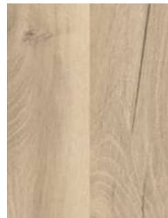
730 River Bed Oak