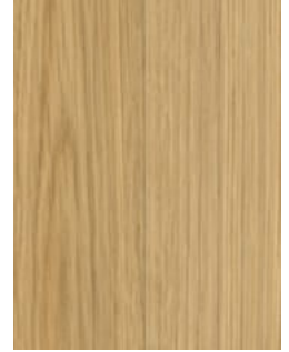
350 Harvest Oak