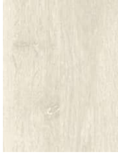
110 Whitewash Oak