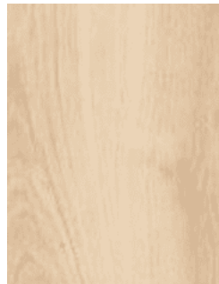
520 Natural Oak