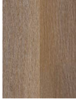
170 Russet Oak