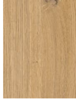
320 Honey Ash Oak