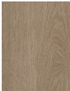
560 Grove Oak