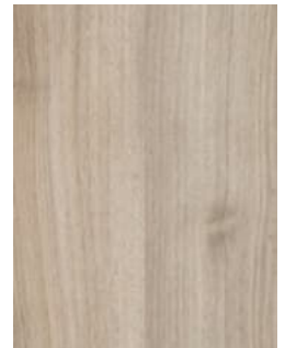
550 Tawny Oak