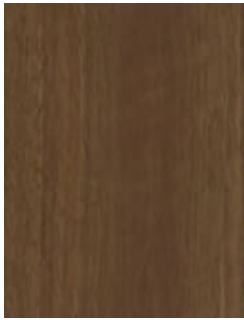
555 Spotted Gum