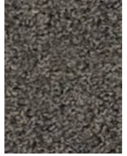
590 Mckenzie Basin