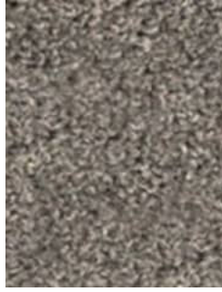
240 Lindis Valley