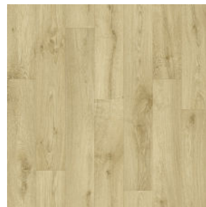
Willow Oak 163M