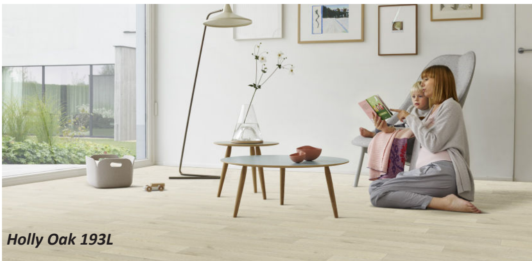
Holly Oak 193L