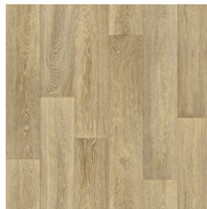
Pure Oak 160M