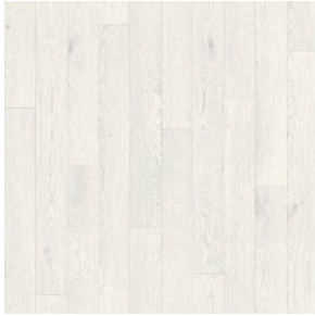
Holy Oak 001S