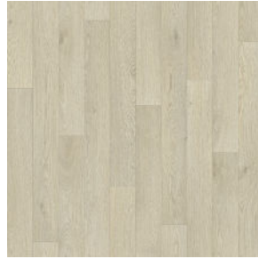
Holly Oak 193L