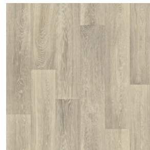
Pure Oak 190L