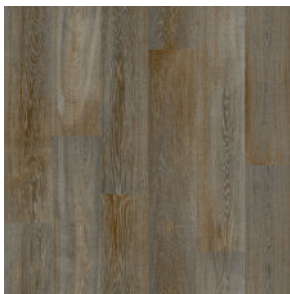
Pure Oak 670D