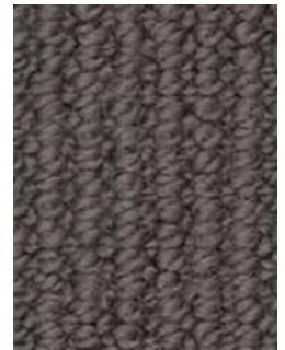
770 Timber Wolf