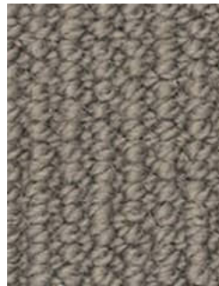
736 Smokey Crystal