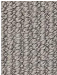
726 Silver Jewel