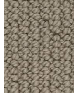
560 River Stone